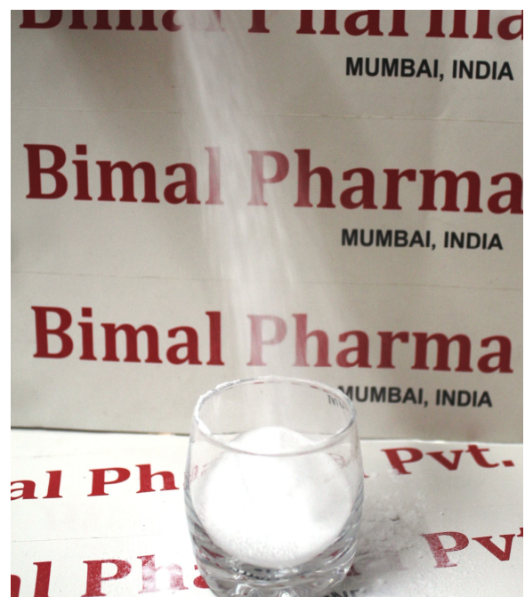
GOOD FLOW ABILITY